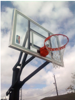
Basketball, Volleyball and Multipurpose court